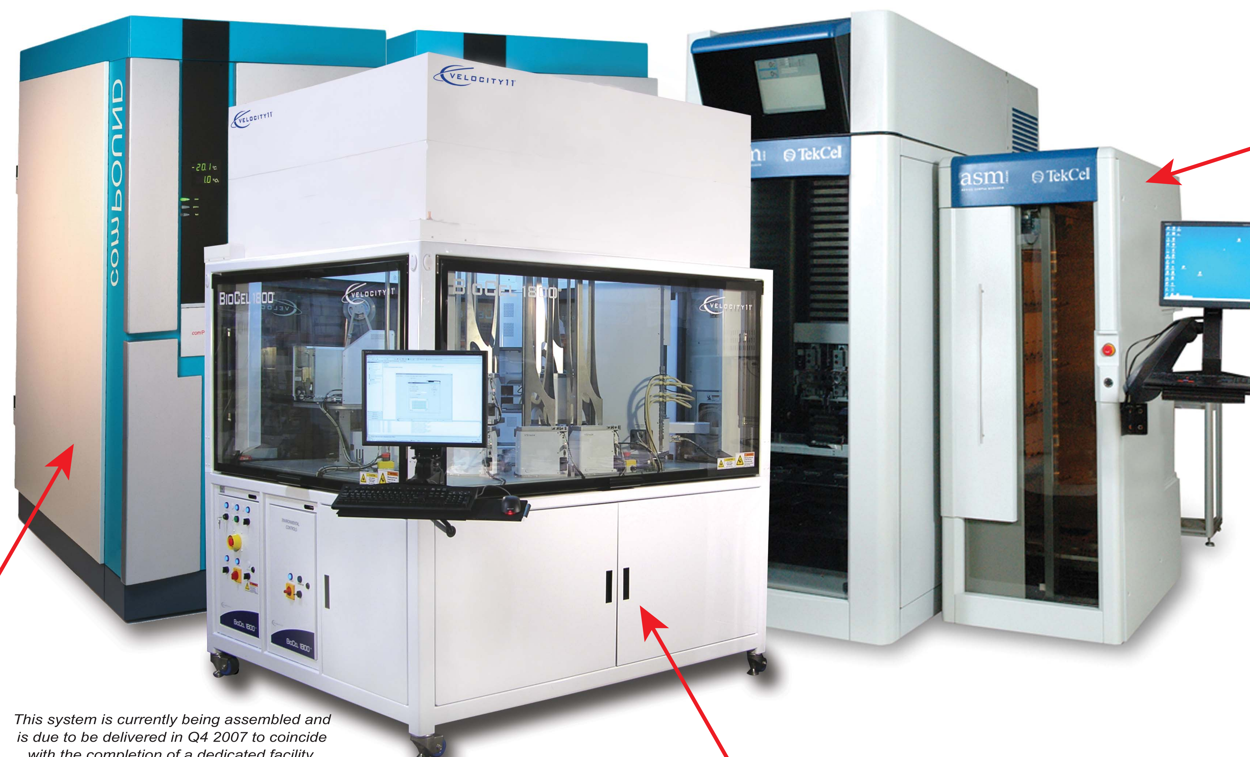
This system is currently being assembled and is due to be delivered in Q4 2007 to coincide with the completion of a dedicated facility.

Requested samples are individually cherry picked from store, so there are no unnecessary thaw cycles, and racks of retrieved tubes can be arrayed in user-specified formats to simplify subsequent plate creation. Each tube carries an individual 2D barcode which is read on the way into and out of the store, so it is impossible to obtain the wrong sample.